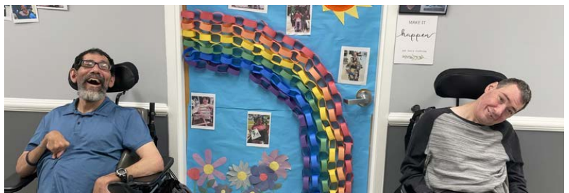
Pictured: Staff from McAuley wearing Juneteenth shirts created by the Marian Center; Residents at McAuley and Developmental Day Services making decorations for Rainbow Celebrations Day.