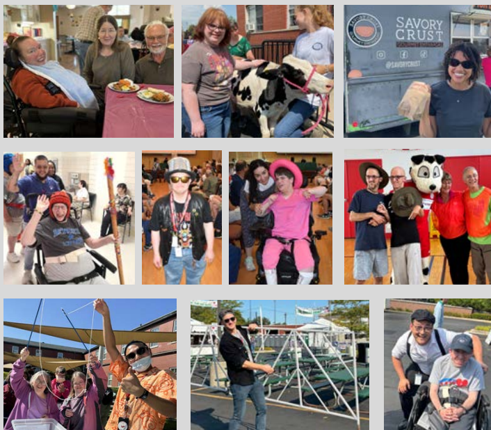
Pictured: Misericordia residents and staff participating in several celebrations during the third quarter of the year: McGowan Christmas in July, 4H Event, Savory Crust Food Truck Event, Disability Pride at Conway, Resident Fashion Show, Chicago Fire Event, Resident Appreciation Day, Family Fest Clean Up, Model T Show.