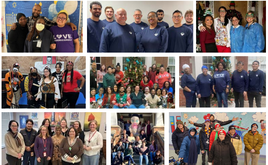
Pictured: Misericordia staff submitted photos from several areas and departments for the holidays.

As the new year begins, there is deep appreciation for the work you do every day with our residents here at Misericordia. Your compassion, patience, and commitment make our mission real in the most human way—through relationships, respect, and daily moments of support and encouragement. And as a result, you give every parent peace of mind.