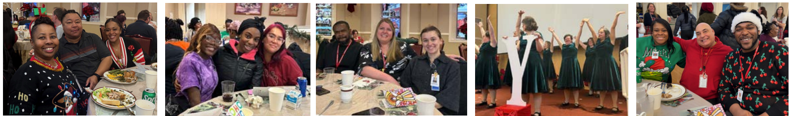
Pictured: A few snapshots of Misericordia staff participating in the Annual Holiday Meal Event, with special performance from the Heartbreakers.