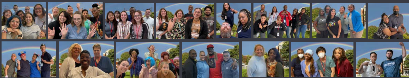
Pictured: Misericordia staff participating in a special photobooth at several staff appreciation and recognition events throughout the year.