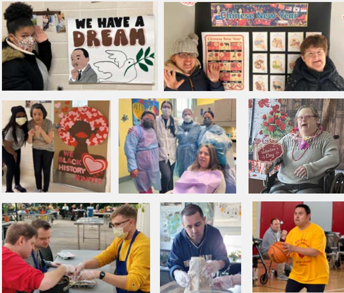
Pictured: Misericordia residents and staff participating in several celebrations during the first quarter of the year: Martin Luther King Jr. Day, Lunar New Year, Black History Month, Dental Clinic 10 th Anniversary, Valentine's Day, Program Arts & Crafts, March Madness.