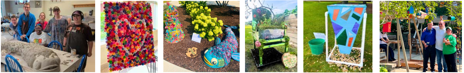
Pictured: Misericordia residents preparing a piece for the Annual Art Walk by Programs, a few of the art pieces displayed around campus, and residents posing as they walk around to view the displays.