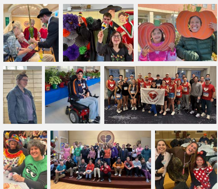
Pictured: Misericordia residents and staff participating in several celebrations during the fourth quarter of the year: Sukkot 2025, Hispanic Heritage Month, Fall Fest at CDS, JG Reptile Show, Runners for Misericordia at the Chicago Marathon, Halloween Dance Party, CILA Talent Show.