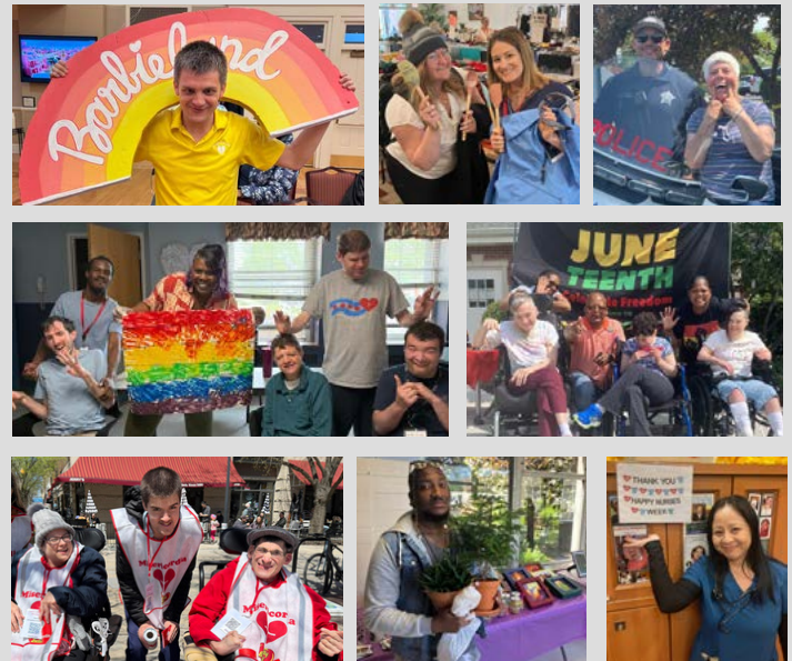
Pictured: Misericordia residents and staff participating in several celebrations during the second quarter of the year: Pink Party, Spring Fling Sale, First Responder's Day, Pride Month, Juneteenth, Candy Days, Summer Market Days, Nurses Week.