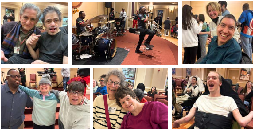
Pictured: Residents, family, and staff at the Golden Street Reggae show in Jean Marie Ryan Center.