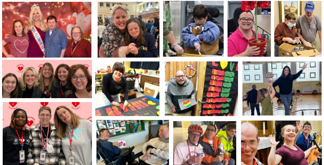
Pictured: Misericordia residents, staff, and families participating in several events in February: Valentine's Day Party, Golden Street Reggae, Greco Gardens Activities, Staff Appreciation Lunch, BHM Activities, Gym Wheel at Conway, Sing-Along, Sports Games, Maot Chitim of Greater Chicago.

"All that you touch, you change. All that you change, changes you." —Octavia E. Butler, American sci-fi author.