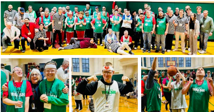
Pictured: Residents, family, and staff playing basketball at a Team Sports event at Walsh.