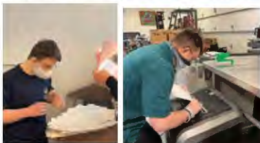
Pictured: Residents working in the Brian Barry Recycling Center.

Click here to learn more about what we recycle. Friendly