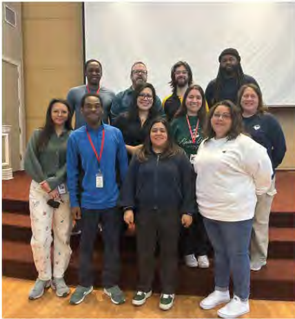
Picture: Some recent graduates of FFS: Tier 2. All graduates had previously completed FFS: Tier 1. Stay tuned for the next Campus Connections Month In Review for the full list of names and their photos.