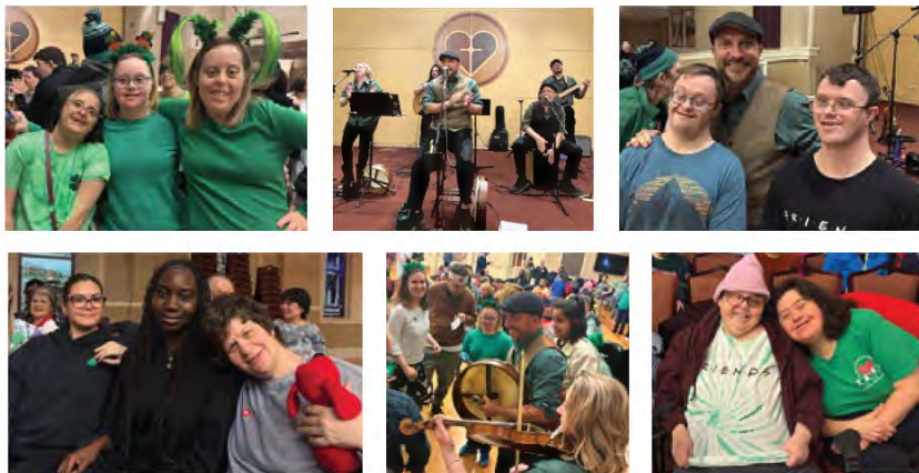
Pictured: Residents, family, and staff attending the Donnybrooks concert at Jean Marie Ryan Center on 3/12.