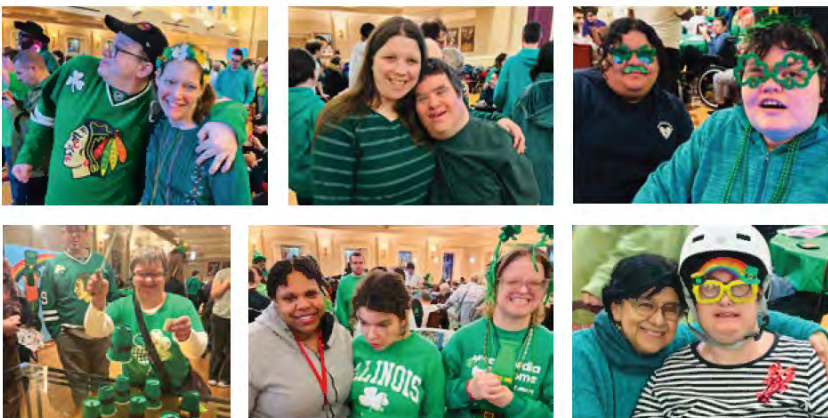
Pictured: Residents, family, and staff participating in St. Patrick's Day Party at Jean Marie Ryan Center on 3/17.