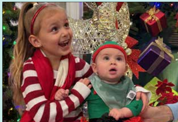
Thank you to everyone who made the Christmas holidays so joyful this year!